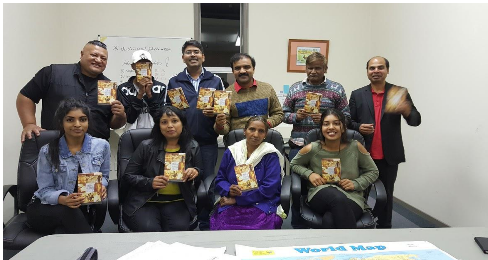
Human Rights Education Program